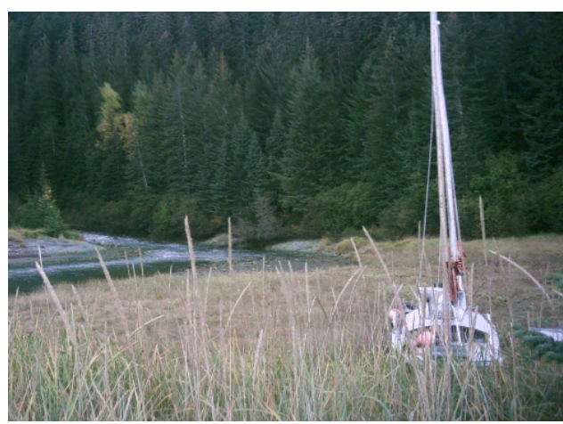
Sweet Little River Meadow

But hunkering is a favorite part of cruising. Fuel for the woodstove literally grows on trees, warms our small, insulated cabin in minutes, and beats time to a parade of gustatory delights. Walking berms of sand or gravel, their strata as smoothly striated and regular as the rings of Saturn, we watch wild winds decapitate the driving swells, vaporize them into sun-dogged spume. We sat out one 80kt storm with 100+kt gusts. Gratefully! Lots of big trees went down in that one.