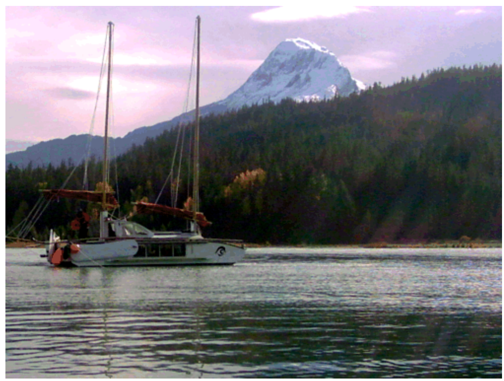
This River Harbor is about to Dry Out