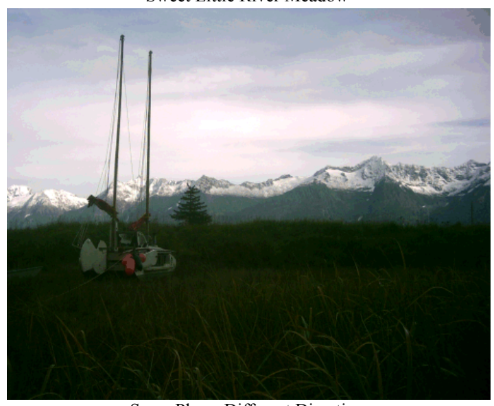
Same Place, Different Direction Lynn Canal, over the Bank

One day, while dried out on a tidal meadow, a doe and two fauns crossed a small but fierce river, about 50yds distant. Mama chose a spot upstream of a sweeper (any limbed tree fallen at right angles to the stream). Sure enough, the two fauns were swept into its branches and pinned by the current. They struggled briefly before fighting free and turning back. Mama, who had successfully forded, recrossed for another family try from the same spot, and with the same results. This time we thought the fauns were done for. But first one and then the other broke through the snare of branches to the downstream side. We breathed again as they walked within a boat-length on their way across our meadow.