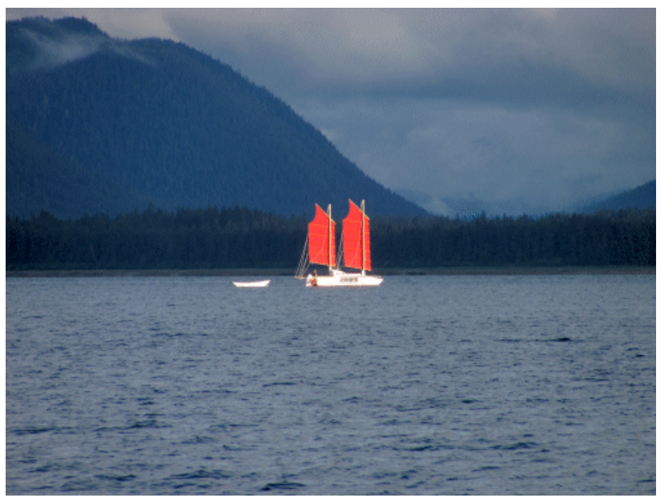
Tenakee Inlet, Port o' Call

We can avoid exposed dry-out on steep beaches, install leveller legs (so far this is another untried pipedream), or install fixed or tensioning structures to back up the compression posts. One could even abandon the trampoline bottom, making it rigid with a composite bottom structure or heavy skegs. Chances are that we'll live with it for the foreseeable future, avoiding exposed, steep beaches.