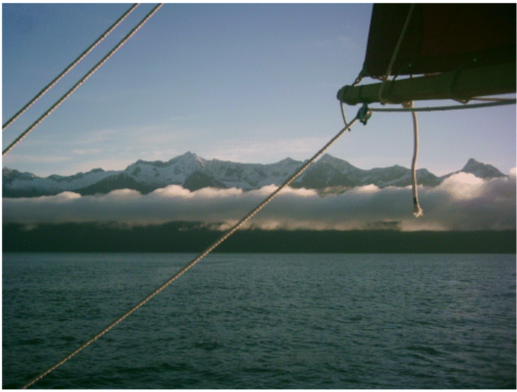
It's not all Autumn Gales

It's both exhilarating and spooky to be storming along like that. Winds that high can and do generate zones of intense wind. NOAA likes to say, "...and higher gusts from interior passes." Boy howdy! Shelter is often located near the mouth of such a pass. Better to run in early than late. In dire case, we may have to run aground on a smoothish beach behind an outcrop. Not an eventuality we court!